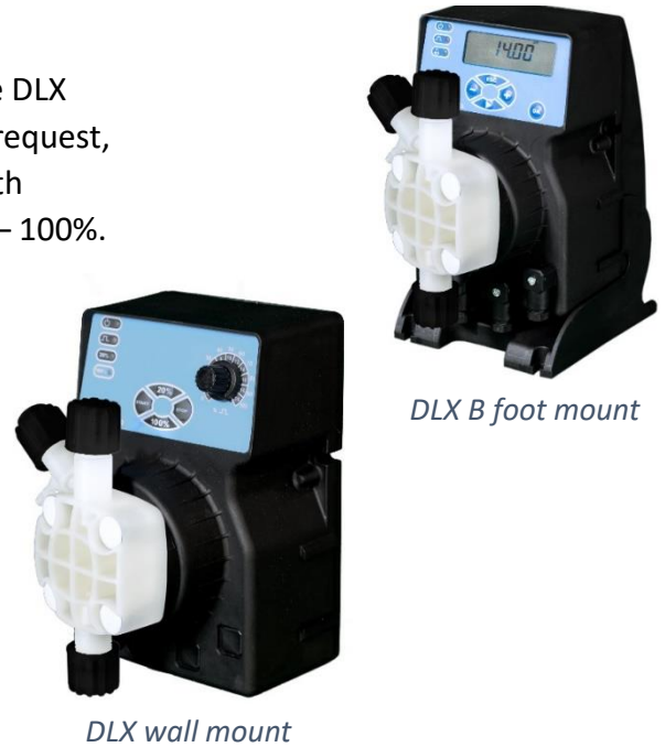
DLX wall mount